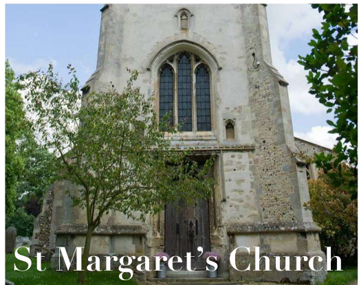
St Margaret's Church