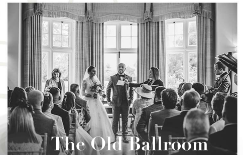
The Old Ballroom